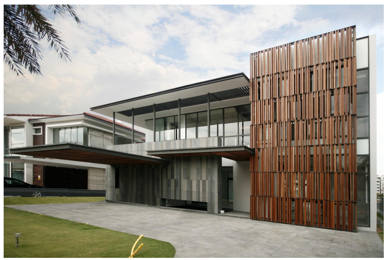
Proposed Erection of 2-storey Detached Dwelling House with Attic & Swimming Pool at Treasure Island B12-08, Sentosa Cove